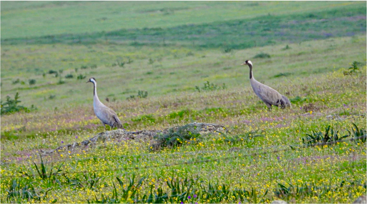
Image n°: Cranes at Serena area, Cabeza del Buey (BA).