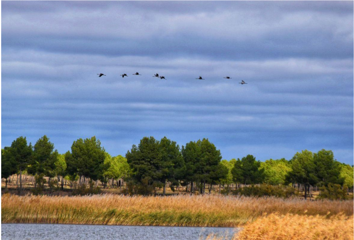
Image nº: Cranes over Villafranca de los Caballeros lagoons (TO).