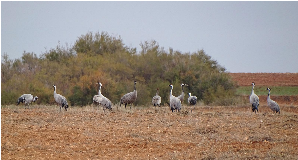
Image nº: Cranes at Dulce lagoon, Campillos (MA).