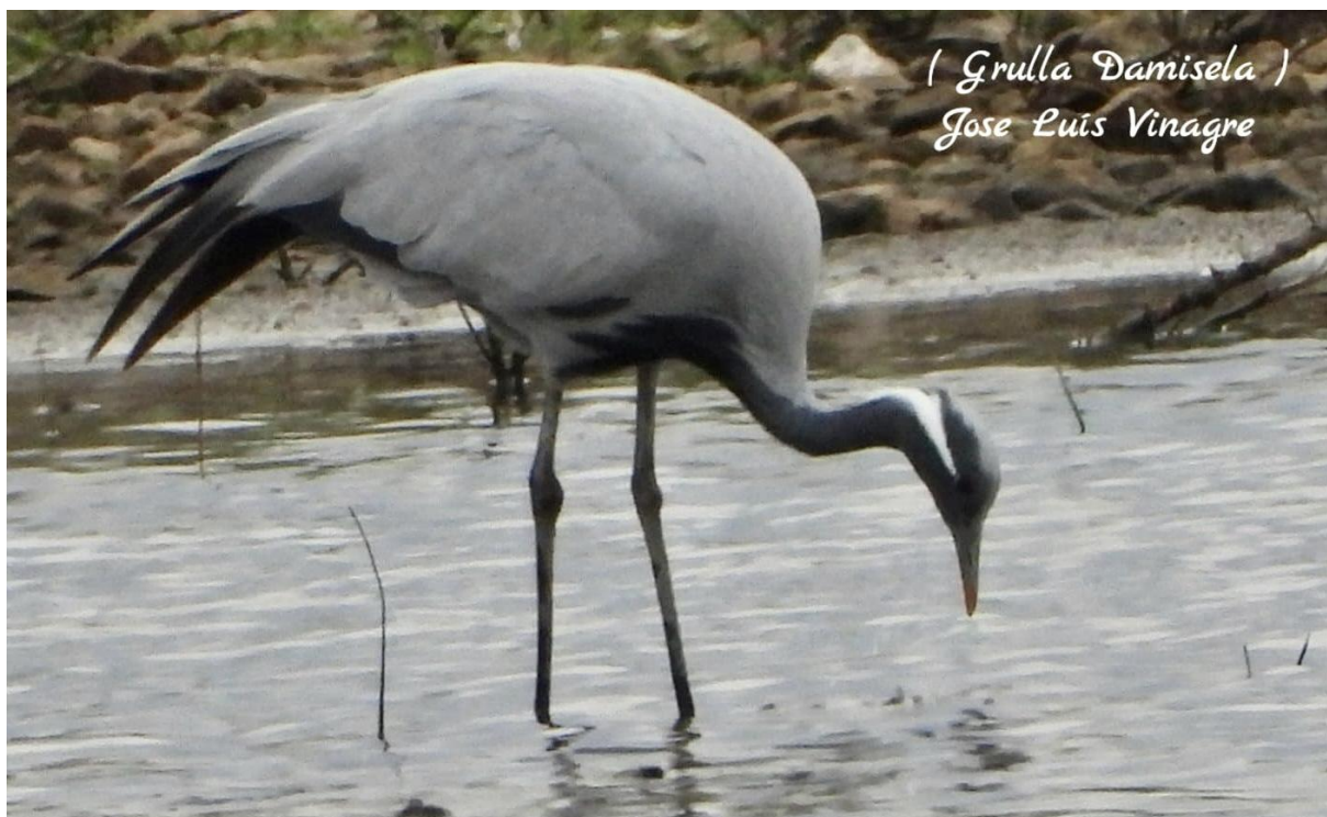
Image nº: Demoiselle crane at Morantes reservoir.

1 demoiselle crane ( Anthropoides virgo ) at Morantes reservoir (BA), probably an escape from captivity, José L. Vinagre.