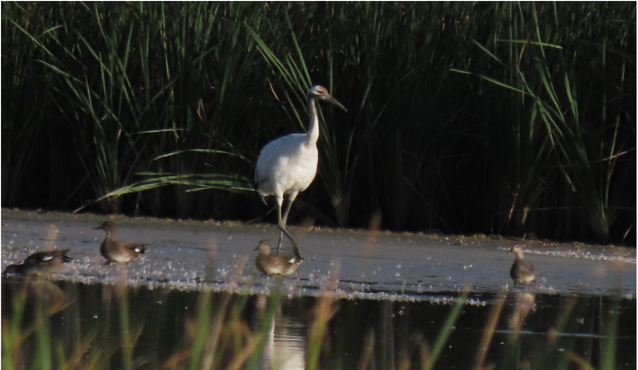
Image nº 7: Red-crowned at La Nava lagoon (P).

09/01/20: 4,880 are counted at Hornborga Lake (SE) Hornborgarsöns Färltstation.