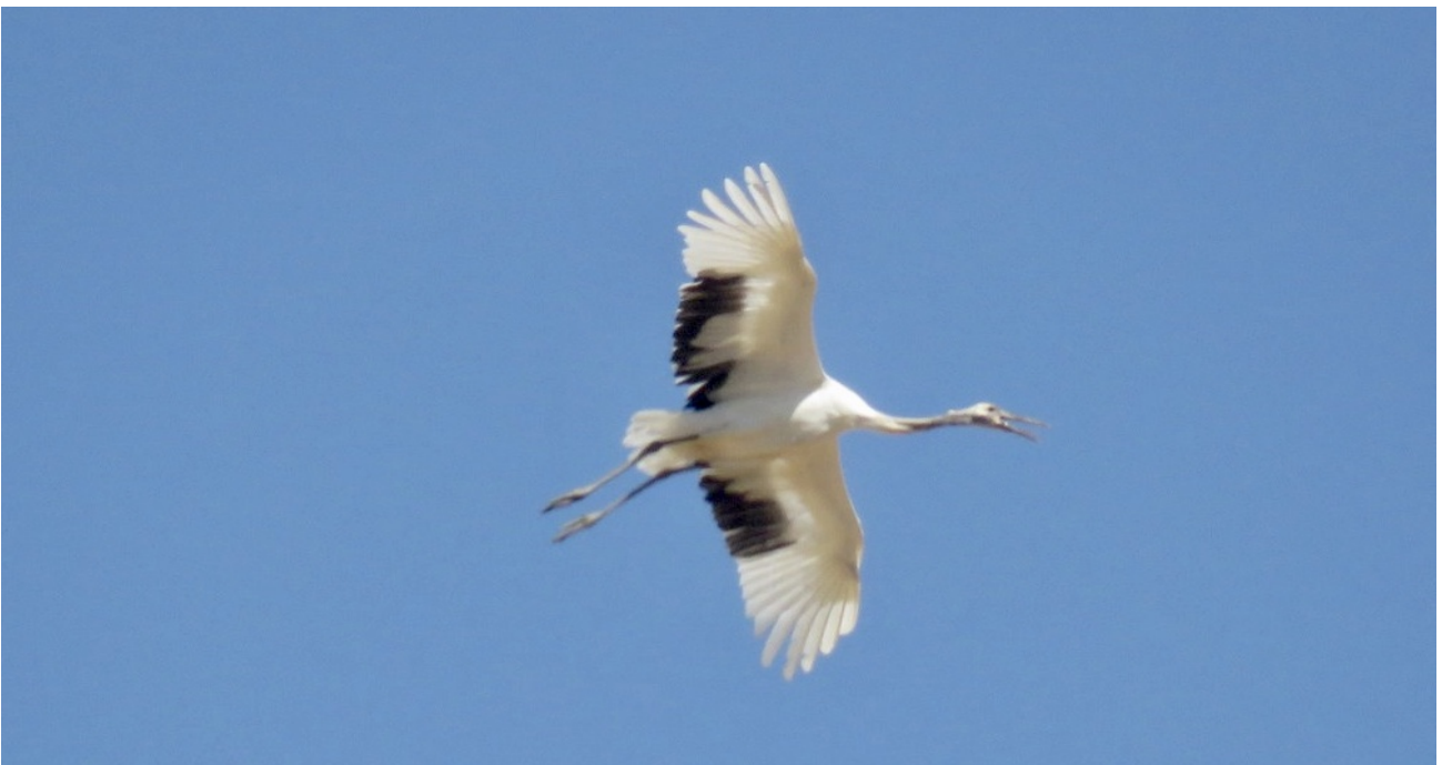
Image nº 6: Red-crowned crane in flight at La Nava lagoon (P).

In all probability, this bird must have escaped from a private collection although it lacked identification rings.