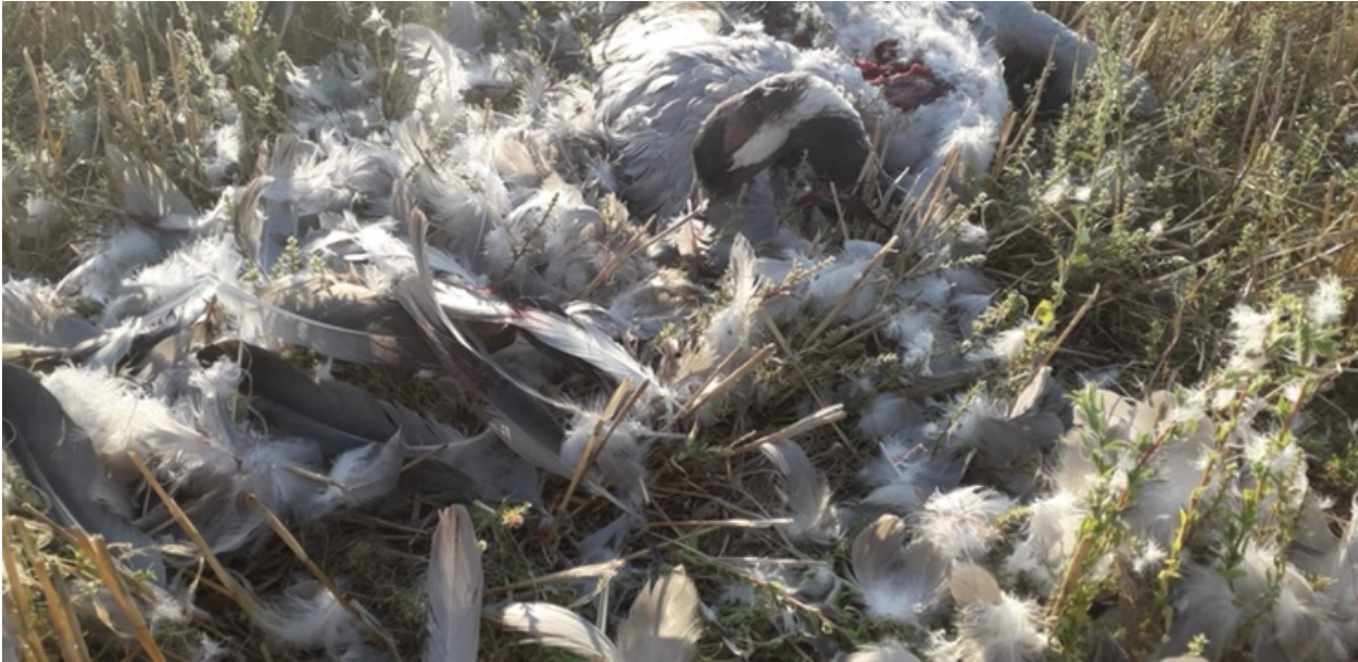
Image nº 5: Crane killed by golden eagles.