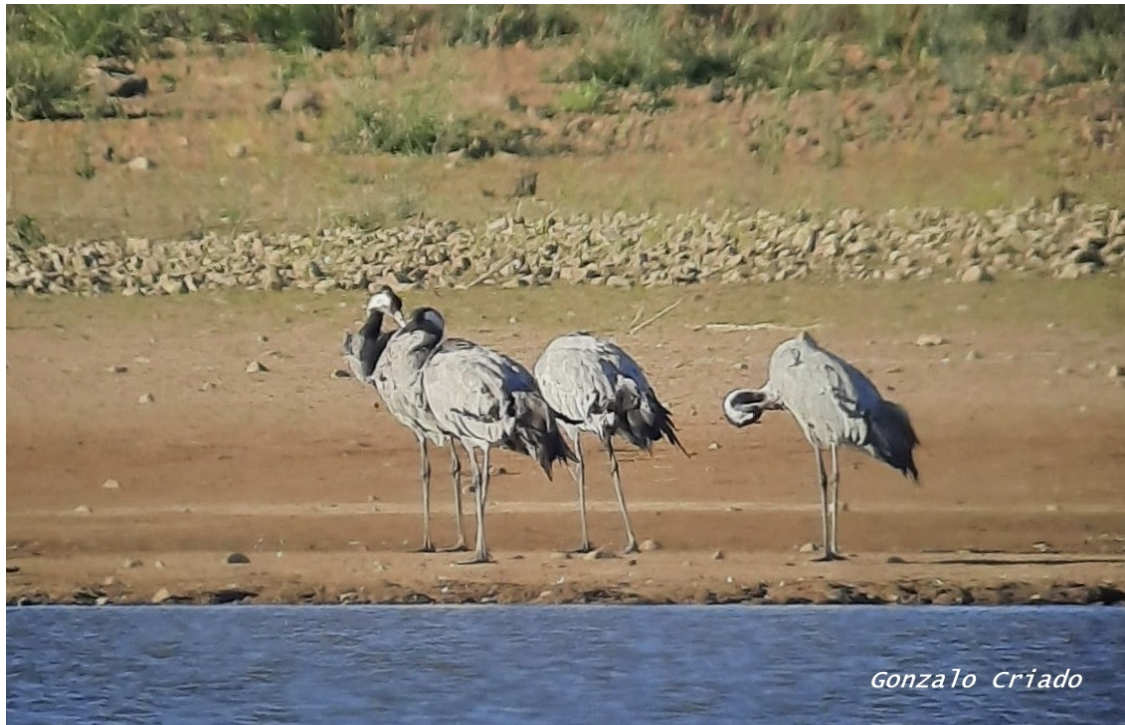
Image no. 11: The first cranes at Los Canchales reservoir (BA) on 14/10/20.