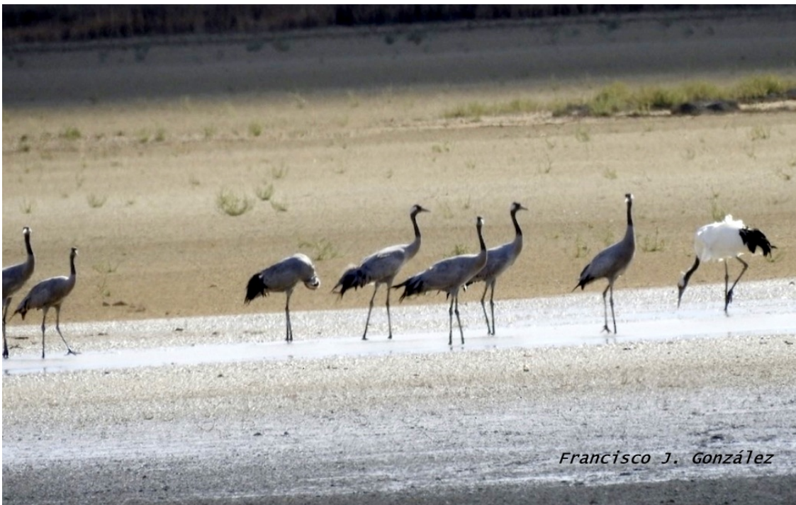
Image no.10: Red-crowned crane ( Grus japonensis ) with common cranes at Villafáfila (ZA). Photo: Juan J. González on 14/10/20 (eBird).