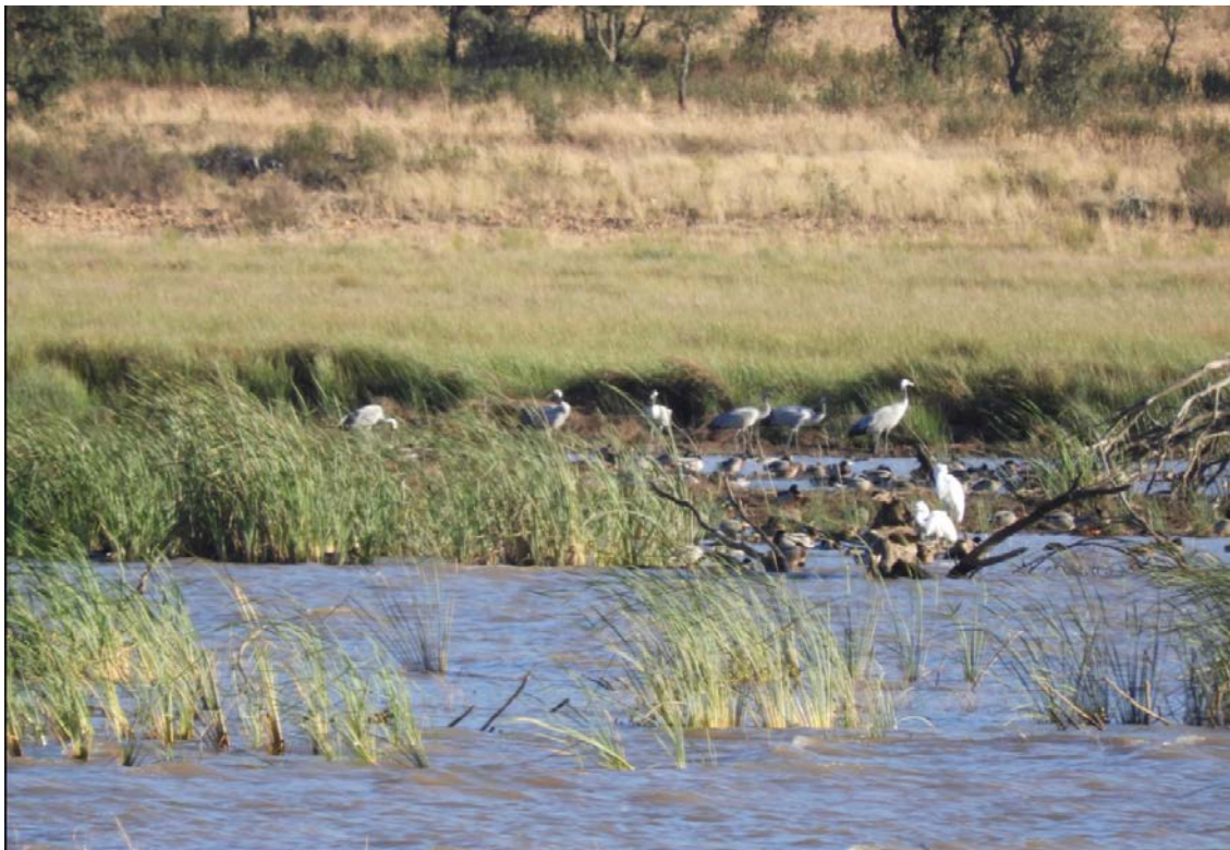
Image no.8: Cranes at Gargáligas reservoir (CC) on 12/10/20.