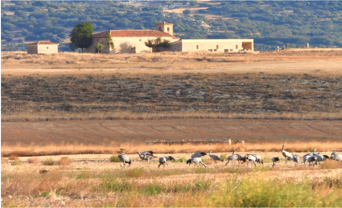
Image no. 9: Cranes at Gallocanta on 13/10/20.