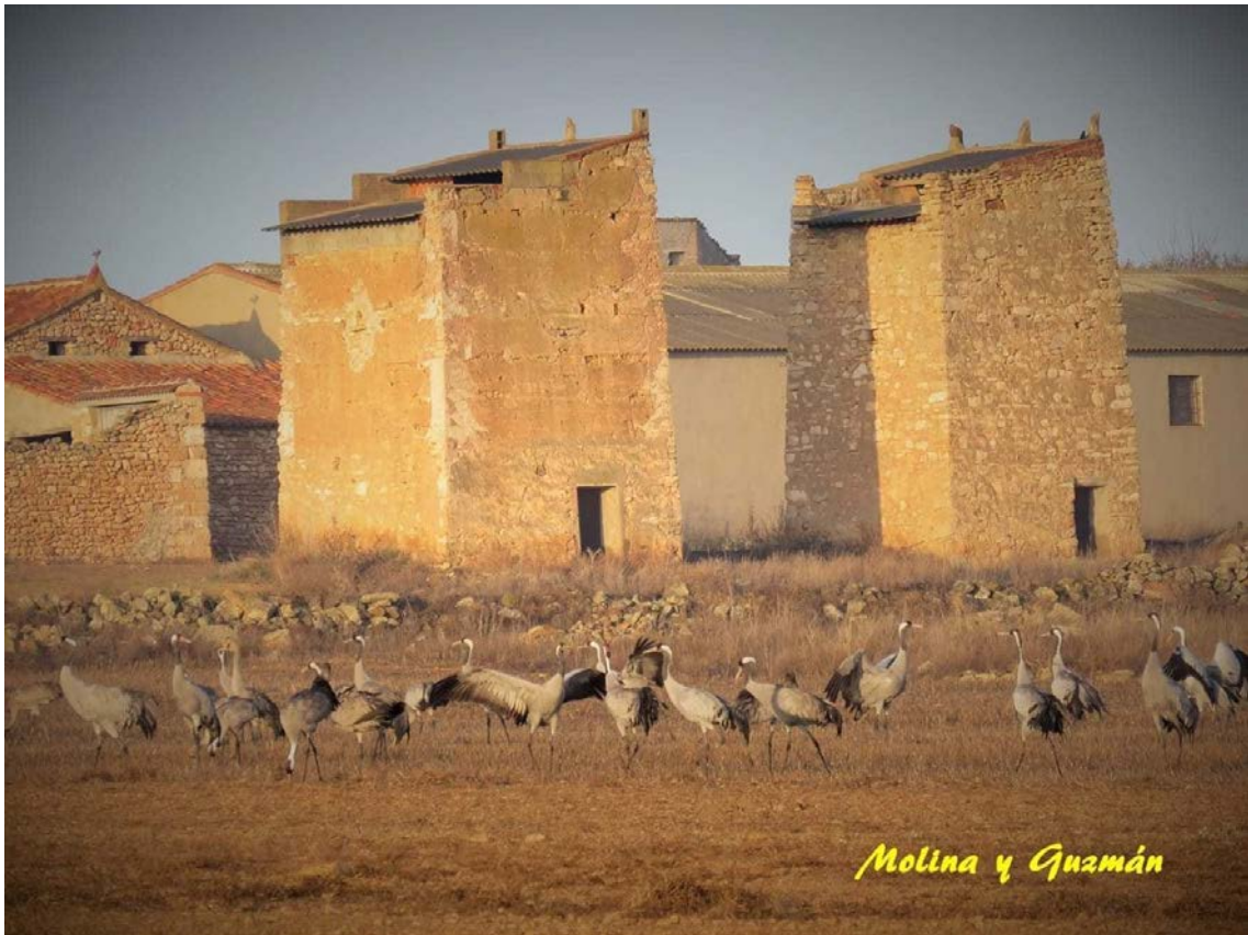
Image no. 24: Cranes on the outskirts of Las Cuerlas (Z)