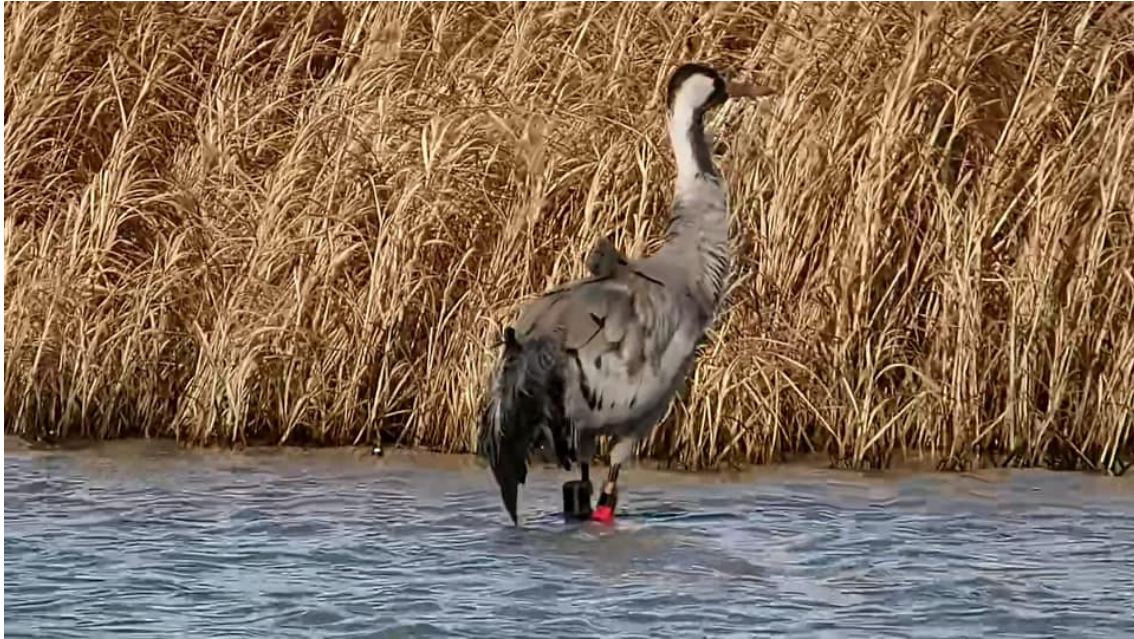
Image no. 23: Biffen at El Hoyo lagoon, El Oso (AV), showing the GPS that it carries on the left leg